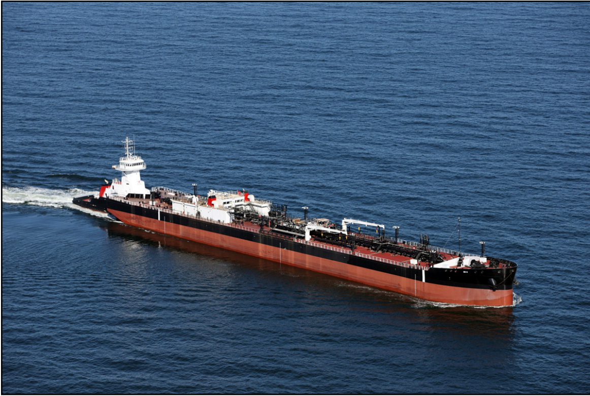
Figure 3. Articulated Tug-Barge (ATB) Vessel