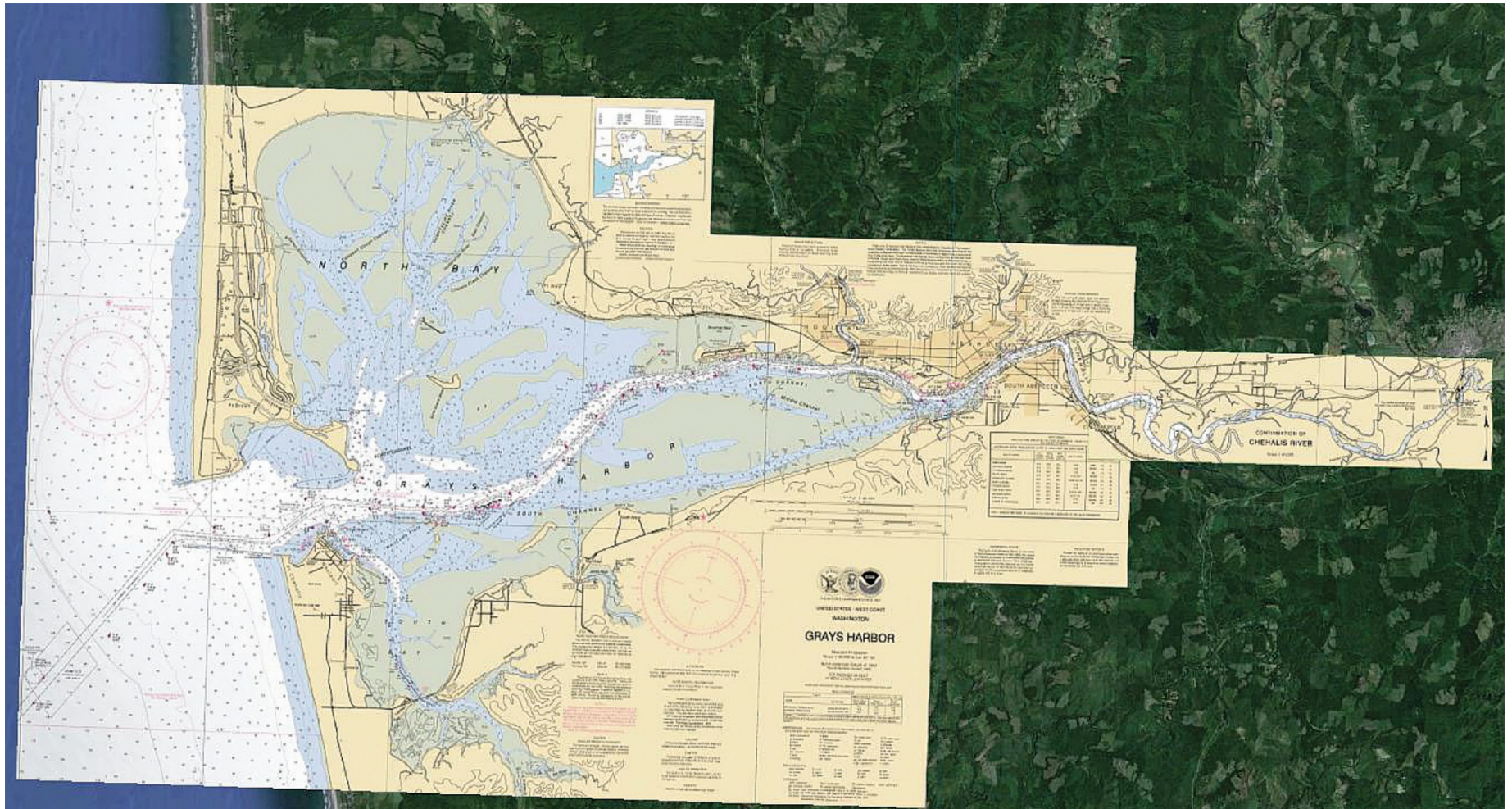
Figure 4. Grays Harbor nautical chart