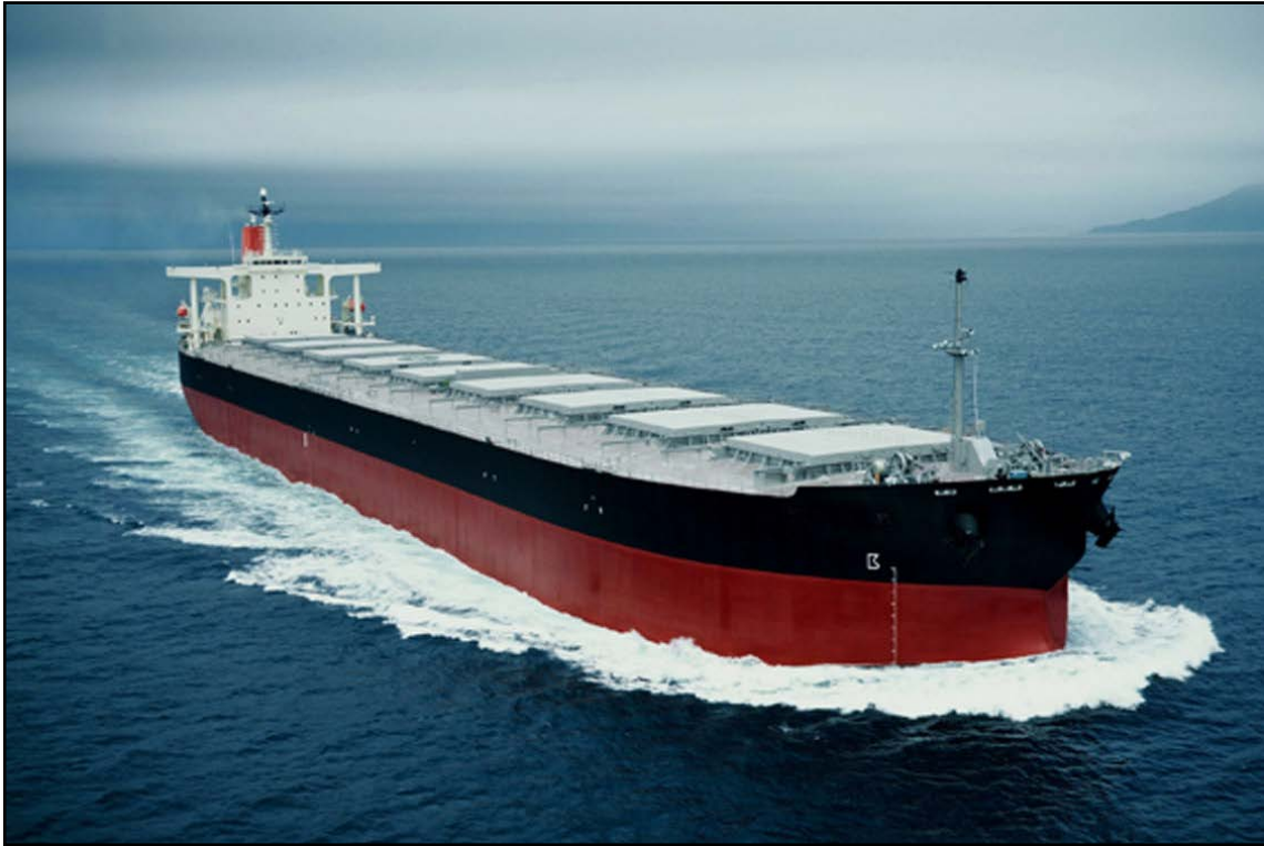
Figure 2. Panamax Class Vessel