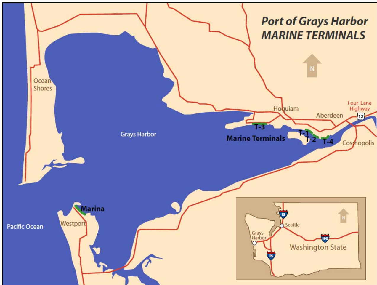
Figure 1. Port of Grays Harbor with Terminal Locations

PGH owns and operates the Westport Marina and has four terminals in the northeast corner of Grays Harbor, in the towns of Hoquiam and Aberdeen. Two current PGH tenants are proposing expansion projects at Terminal 1 (T1), and a third company is proposing constructing a new facility at Terminal 3 (T3) (Figure 1).